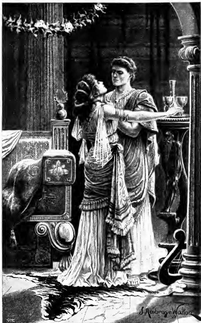
"The white hand . . . shifted the position of the goblets." (Page 223.) The Gladiators [Frontispiece]